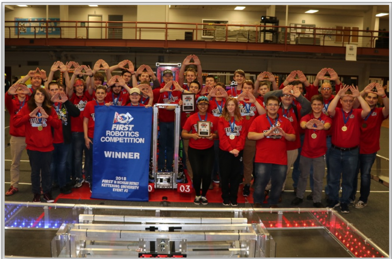
Pictured above: The TriSonics after winning our first event of the season over at Kettering in Flint!

The TriSonics take home the blue banner at their first event! Last weekend, the TriSonics competed at their first event at Kettering University in Flint, Michigan. After the six week build season, all of the team's hard work came to fruition. The team arrived at the event on Thursday to set up and matches began on Friday morning. Also on Friday, Chairman's team presented to the judges. After qualification matches on Saturday morning, the TriSonics were ranked #1 out of 39 teams. Competing on the #1 alliance, the TriSonics won the entire event with the help of FRC 494, Martians, and FRC 7144, NexTech Hydra. The TriSonics are competing at the West Michigan District at Grand Valley State University on March 22-24.