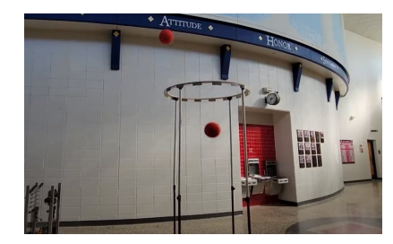
game elements into the hoop.

The design team released all the drawings for our robot except the hanging system. We logged all our progress on our spreadsheet. We plan to push through our next week with 100% focus on our hanging system. We are hoping to have it completed by our first competition. This is a picture of our current state robot shooting